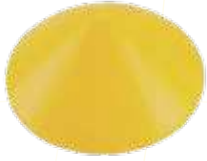
MTLX0103016 Tapa para comedero de pre-inicio Lid - Pre starting feeder