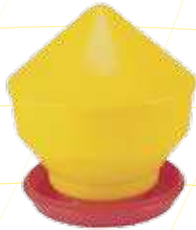
CDPX0104002 Comedero de preinicio completo Complete Pre starting feeder - with Lid