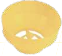
CDPX0103002 Tolva para comedero de preinicio Hopper Pre starting feeder