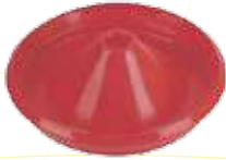
CDPX0103001 Plato para comedero de preinicio Pan Pre starting feeder