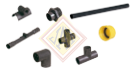
PVC Pipes and connections