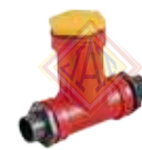
FPAV0104001 1" Water filter