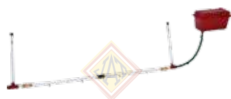
SABN0101001 Prolife automatic drinker system