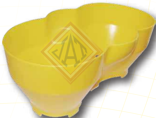
CDPC0103002 Hopper easy grow feeder