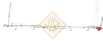
Prolife automatic drinker system