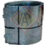
RDLX0204001 Antimigratory lamina