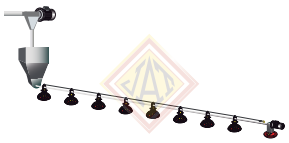
Broilermatic automatic feeder system