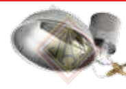
CPLX0204001 Breeder for piglet.