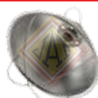
CPCX0304001 Electri breeder for pig.