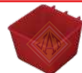
BCGX0104003 Feeder / drinker 900 ml.