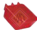
BCGX0104002 Feeder / drinker 500 ml.